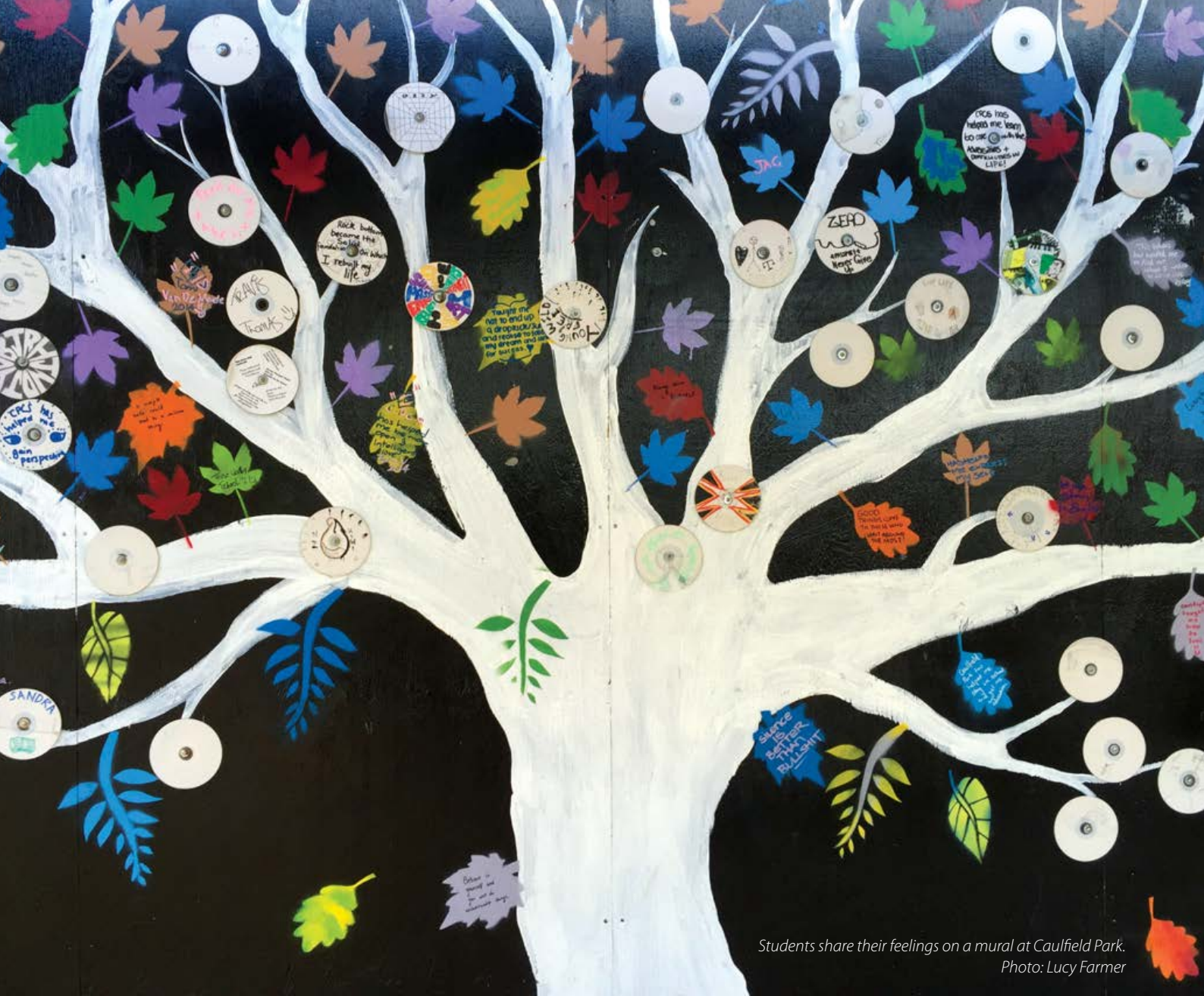
Students share their feelings on a mural at Caulfield Park.